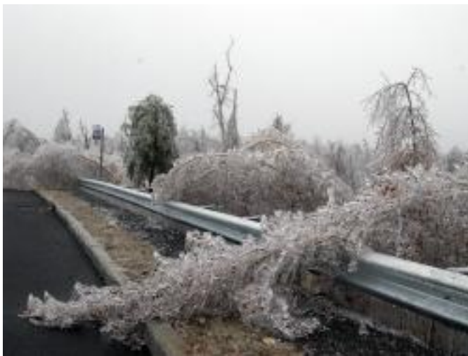
Many trees were bent or broken due to the large amounts of ice that froze on them.