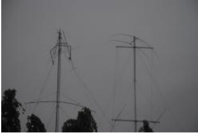
The 15 and 80 meter towers at KC1XX suffered severe damage in the ice storm.