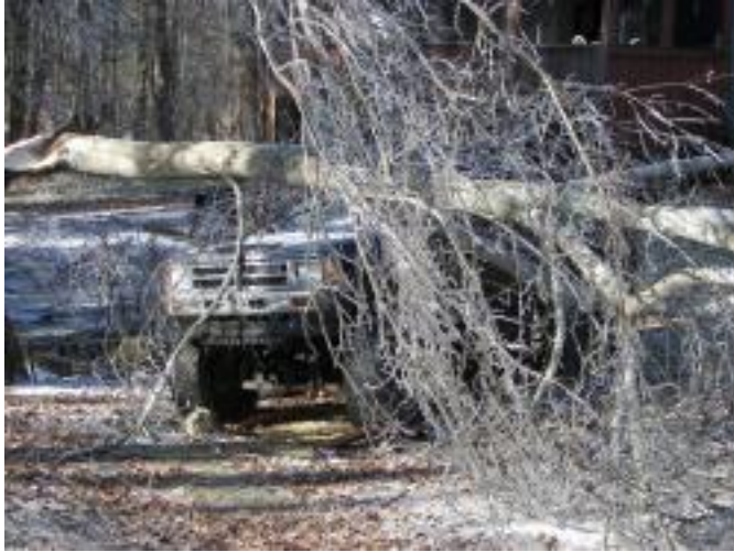
This car in Montgomery, Massachusetts, definitely felt the effects of the ice storm!