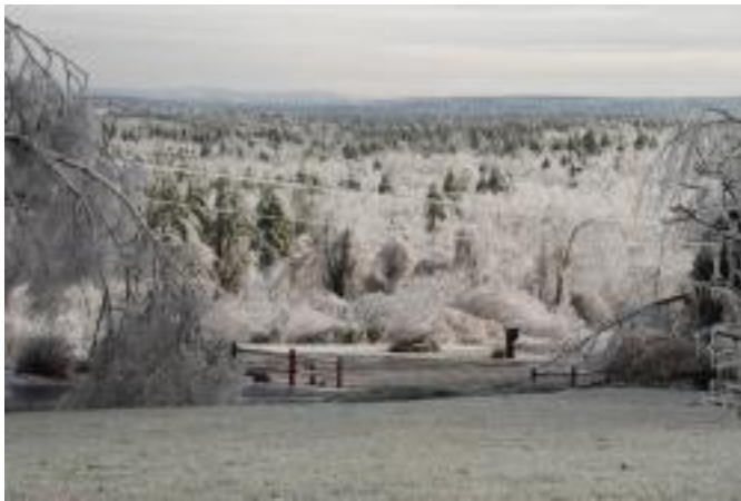
The view to the east from KC1XX's QTH.

As a major ice storm -- accompanied by freezing rains, flooding and strong winds -- severely impacted New England on Thursday evening into Friday morning, ARES®, RACES, SKYWARN and MARS operators worked together to respond to calls for assistance from served agencies and to participate in the recovery phase of the storm. As the storm progressed into the weekend, ice accumulations up to 1.5 inches were common throughout a very large area of Western, Central and Northeast Massachusetts, as well as parts of New Hampshire and Maine.