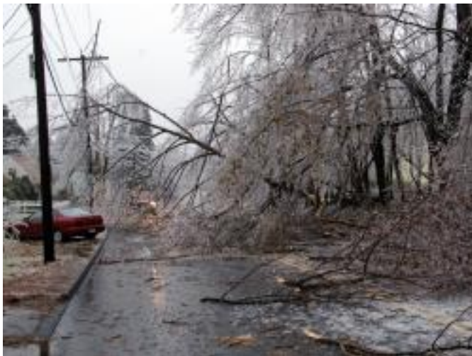
Many roads were blocked by downed trees in Worcester, Massachusetts after the ice storm.