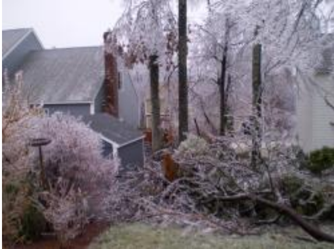
Homes in Worcester, Massachusetts were also affected by the ice storm.