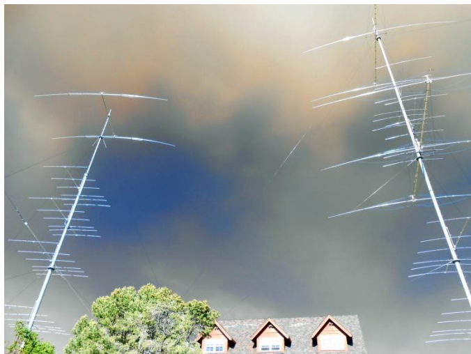
A pair of rotating monopoles holding multiple stacked antennas at W7RN.

Little was said of antennas in the 1930 Sweepstakes report, but it’s safe to assume wire antennas were the norm. Most articles of the day referred to coupling to single-wire feed lines and Hertz antennas or doublets and even today, some stations achieve outstanding results in this domestic contest using nothing more than the average city-lot antenna farm.