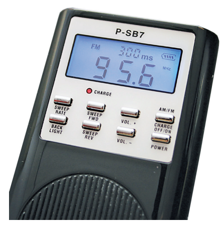
The B-PSB7 Spirit Box, a common model sold from various online ghost hunting equipment vendors.

For a quirky afternoon project, an online search will bring up pages of tutorials to DIY your own spirit box. While fun to try, the evidence recorded is often taken with a grain of salt, as any interpretations of communication can be explained away as interference from ongoing broadcasts, or the mind's desire to make sense of white noise by finding words in its chaos.